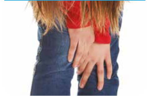
Legs turn to jelly