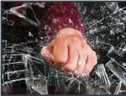
Damage to property

Some examples of antisocial behaviour are: